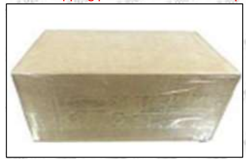
Pic No. 2 Domestic express packaging: Wrapped by Transparent tape black protective film

A Minors are prohibited from using transparent tape, yellow tape, black wrapping protective film, and white wrapping protective film to avoid personal injury.