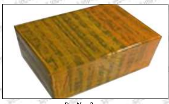
Pic No. 3 International express packaging: Wrapped with yellow tape after wrapping